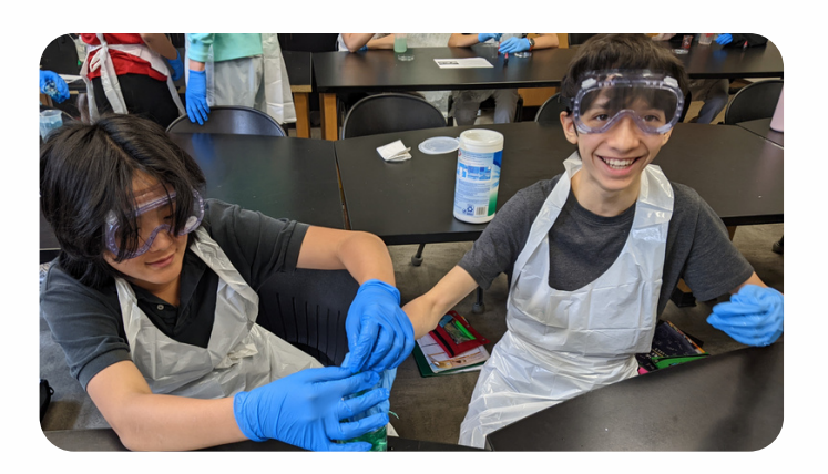
Eighth graders in Ms. Hall's science class creating synthetic products, such as gummy worms.

The fifth grade class completed several STEM engineering activities last school year. A highlight was the rocket unit. Students used a CAD program to design rocket fins which would allow their experimental rockets to fly high and with maximum stability. This year, we will be piloting the use of a 2D cutter and 3D machine to more precisely cut rocket fin shapes & 3D print a nose cone. The sixth grade class designed and built models of what a new salmon fish ladder might look like on the Lake Merwin Dam. This timely STEM project was to address a real-world future engineering need due to a recent decision to return Salmon to the Mt. St. Helens area. Additionally, the sixth graders experimented with constructing solar vehicles as part of their natural resource unit of study.